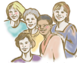
Women of the Church