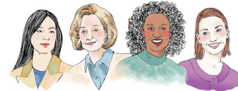
Bible Study for Women