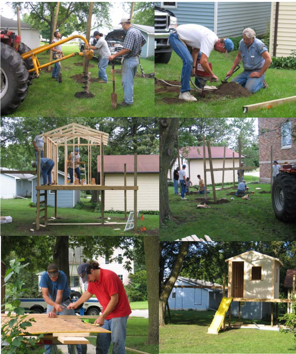
Some pictures of the project!

This meeting will be an excellent opportunity to hear all the pros and cons. The representatives that evening will be the contact people for our area, so please mark your calendars with Monday, September 19th and plan to be here that evening at 7:00 P.M. Refreshments will be served following in Zion's Fellowship Hall in the church basement.