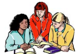
Women's Bible Study